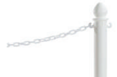
10' Plastic Chain