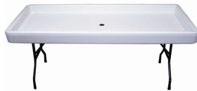
Fill & Chill Table (includes plug) 4' x 30" | $45.00 6' x 30" | $45.00