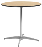
Sit Down Bistro Tables 36" Top | Seats 4 | $14.50