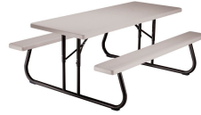
Plastic Folding Picnic Tables 6' | Seats 8 | $25.00