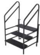
Three Step Staircase with Handrail