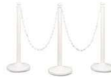
White Plastic Stanchion Post