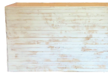
White Wash Bar $150.00