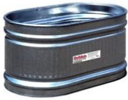
Beverage Troughs Available in various sizes. Please inquire $30.00