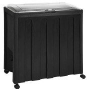
Flip Top Cooler on Wheels $55.00