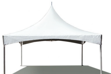
20x20 Frame Tent $495.00 average buffet seating: 32

FRAME TENT: Self Supporting. No center pole. Secured by tent weights, or staking into ground. Installation on grass only.