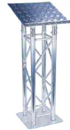
Diamond Plate Podium