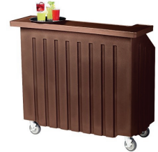
Rolling Port-A-Bar Collapsible, includes a built in ice well $95.00