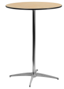
Stand Up Cocktail Tables 30" Top | $14.50