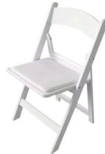
White Folding Resin Chair with Padded Seat $4.50