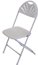
Seashell White Folding Metal Chair $3.50