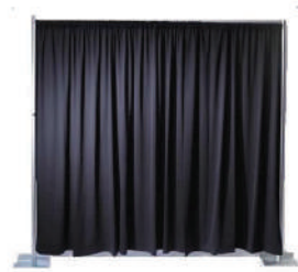
8 Foot Tall Pipe and Drape | $3.50 per linear foot

Expandable cross bar: 6 Feet, 8 Feet or 10 Feet