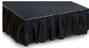
Black Stage Skirting

Each leg adjusts independently from 16" in height to 28" in height.