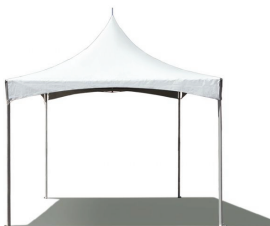
10x10 Frame Tent $209.00 average buffet seating: 8