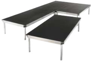
4' x 8' Sections